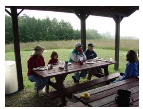
AGS fliers turned out for some good eats and they donated food to benefit CHOW

This year's event takes place on September 27<sup>th</sup> at 10:00am.We need helpers and fliers; I will have a signup sheet at the next meeting or you can contact me via email at ifelice@stny.rr.com