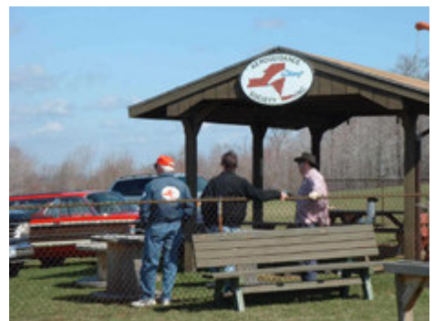
AGS Members take a break after preparing the field for another year of flying

There are no Associate Members to vote on at the June meeting.