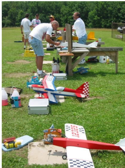
AGS Celebration of Flight —Page 7

Have a great meeting, and contest. I'll see you at the field.