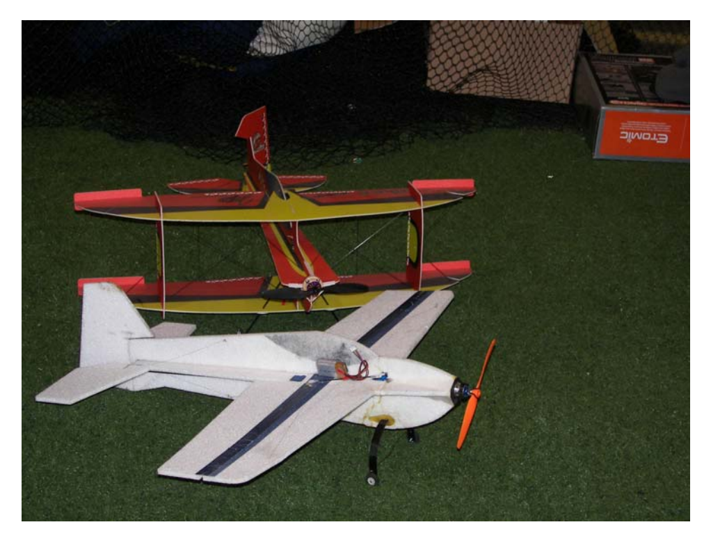
(Continued on page 5)

The airplanes on Saturday are very different for indoor flying.