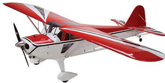
Taylorcraft 20 cc ARF by Hangar 9