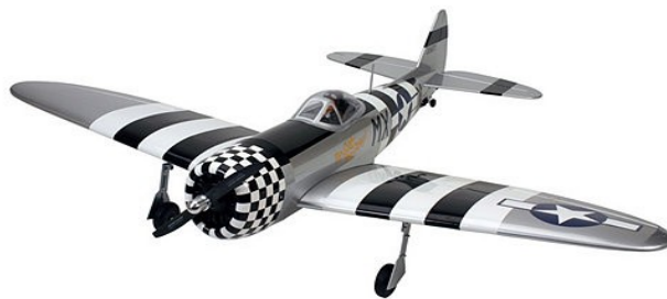
P-47 Thunderbolt 60 ARF by Hangar 9

I will be contacting the rest of the available members to fill in the other needed jobs. My thanks in advance to all those who will again help this year.