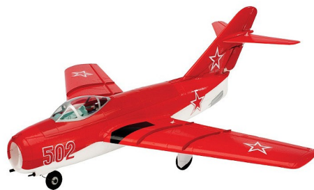
UMX MiG 15 DF BNF by E-flite