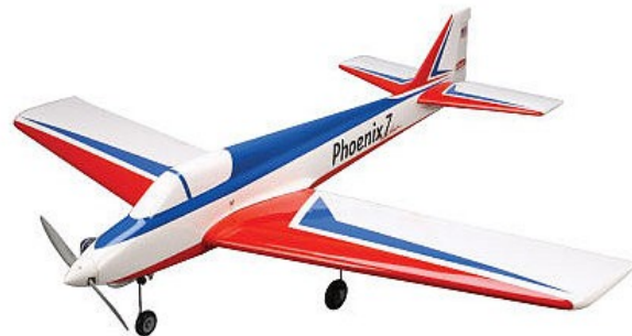
Phoenix 7 Pattern 60 ARF

I also want to tell the guys who help set up and tear down every year how much I appreciate their efforts. Without all of you this event could never happen. I am always impressed how the members never let me down. What a great bunch we are! Thank you all again.