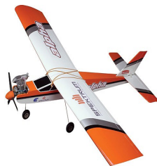
Alpha 40 DSM2 RTF Trainer

Calling all trainer airplanes! There are a lot of members with trainer airplanes so let's bring them out for test flying and trimming.