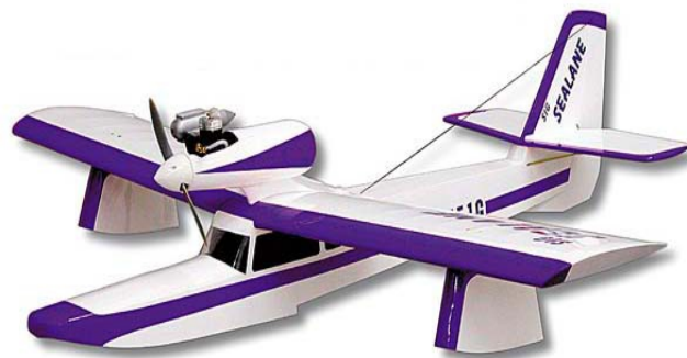
“Sea Lane” by Sig Manufacturing Co.

As stated above, I will be presenting a program on float flying at the meeting on September 10 th . I hope that you will all consider getting a set of floats for your plane, or maybe picking up a model of a sea plane, and coming out to the lake to try a new twist on flying. I can guarantee that you will have a great time.