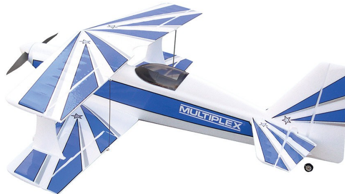
Gemini Biplane Electric Kit by Multiplex Model Sport USA