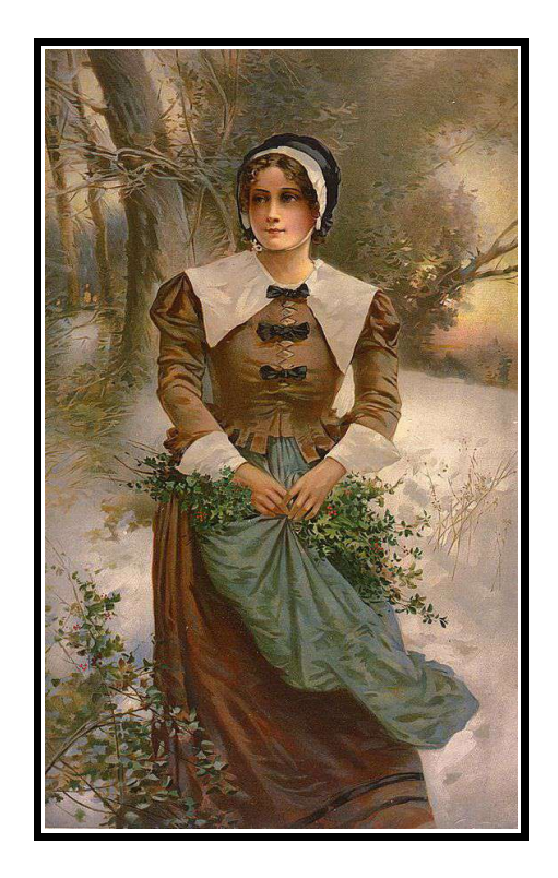
Happy Thanksgiving from the AGS

So mark your calendar for the meeting on November 4<sup>th</sup> and stop by the Endicott Library at 6:45 PM for our monthly meeting and another flight training course. Previous military service not required!