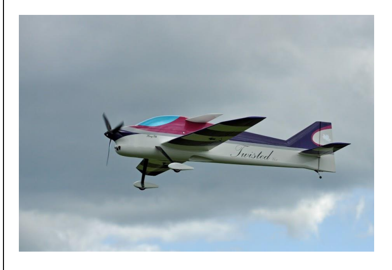
Pattern model in flight