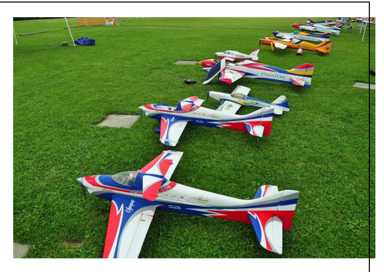
Pattern models lined up at the AGS Aerobatics Contest