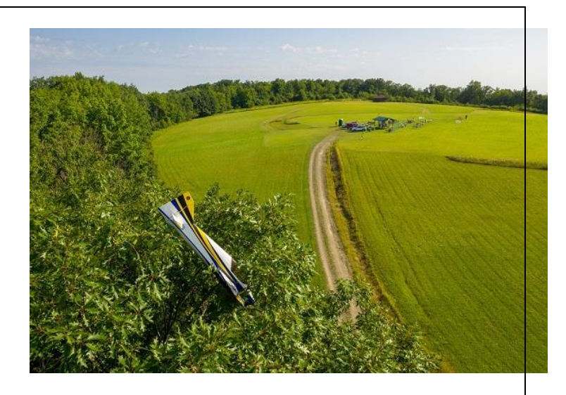
Bill Green's pattern model enjoying a bird's eye view of the AGS field