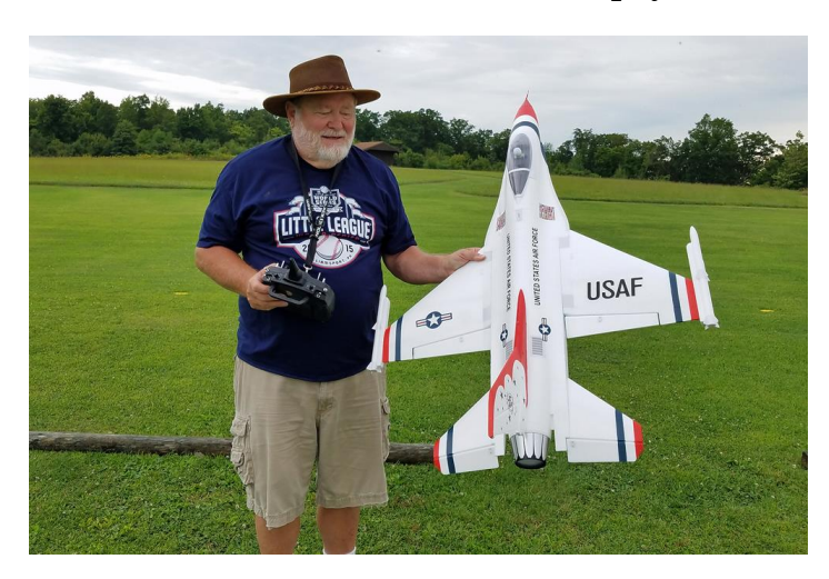
Ron Sprague's F-16 in Thunderbirds Colors