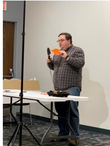
Meeting was adjourned at 7:55 PM.