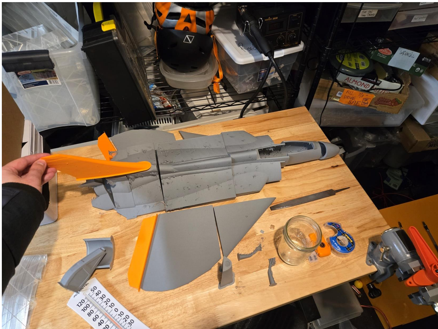
Figure 2-1: The unassembled Skyray

All the parts are printed, I just need to find time to assemble it. Currently I'm limited to working in short bursts over several days until I find a way to vent superglue fumes better in my garage. I forgot to enable "avoid crossing perimeters" when printing the fuselage section, so I've resigned myself to spending a lot of time with a scraper and brass brush to remove the stringing present all over the airframe. Oh well, lesson learned!